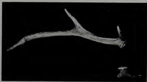
Fig. 11. Normal and accreted antlers of red deer stag Fernando cast in April 1966